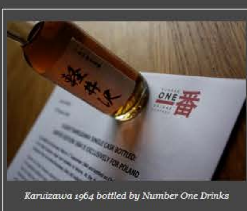
Karuizawa 1964 bottled by Number One Drinks

The Karuizawa 1964 is the oldest Karuizawa released to date. It hails from cask #3603 and has spent over 48 years maturing in Japan in a 400 litre sherry oak cask following its filling on 1 September 1964 and bottling 24 December 2012. The vast majority of its life was spent in a dunnage warehouse at the now sadly closed Karuizawa distillery before it was moved to Chichibu for bottling. After 48 years the whisky is still an incredibly high 57.7% ABV; this is down to a variety of factors – high filling strength and a maturation in a microclimate in which the temperature and humidity combine to force the water to evaporate before the alcohol does. This also ensures that the aromas and flavours in the whisky are concentrated giving us this fantastic spirit almost half a century later.