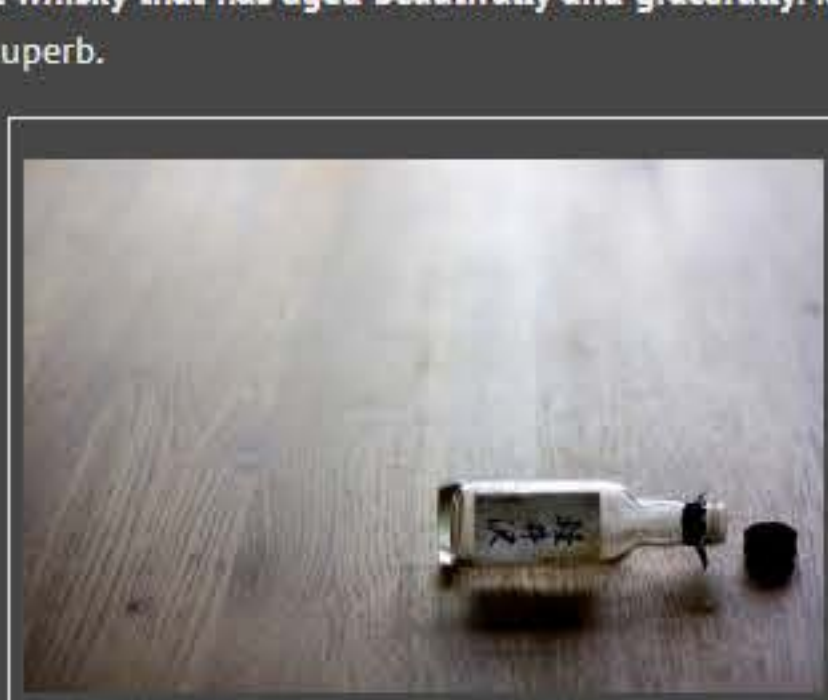
It was majestic

This is a massive whisky, mouth filling and mouth coating with depth that we have not experienced before. Epic is a word that is often banded around and overused. Not in this case – this spirit is epic. Is it worth £9000 a bottle? Impossible for us to say, although we can appreciate the value due to the scarcity and brilliance of the liquid. What we can tell you is that this whisky is worth the hype it has generated; every facet of it is sublime and it is almost certainly the best whisky we have ever tasted. Few whiskies make me smile fondly as I write about them. This one sees me practically grinning. It is a seminal moment in our tasting history, brought about by a fantastic whisky that has aged beautifully and gracefully . It is utterly superb.